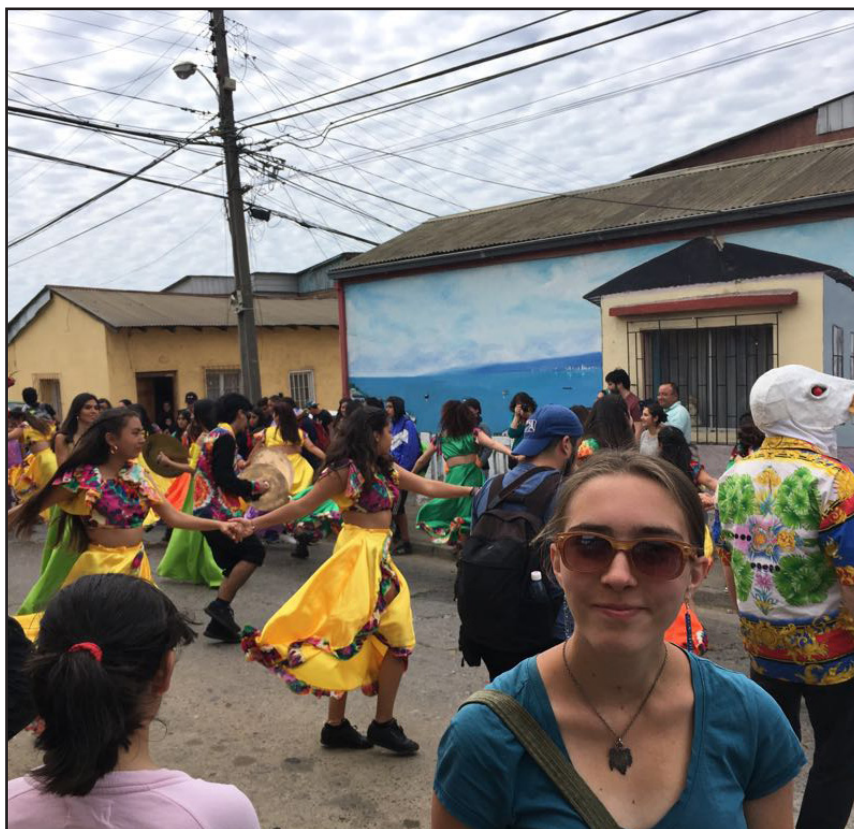
Above: The Festival Mil Tambores in Valparaiso, with my host sister's musical group dancing through the streets.

I chose to study in Chile because I thought it might be my only chance to go to South America. Now I want to go back! Middlebury in Chile was a great program for me, with a perfect balance of leaving students free to have our own experiences and make our own mistakes while always being there to help us deal with bureaucratic universities and personal issues. Their language pledge was valuable, since it clarified our intention to truly learn Spanish; more than anything, it was a good excuse to pull out when Chileans wanted to practice their English with me. Speaking Spanish all the time, even with your English-speaking friends in the program, is challenging but definitely worth it. I know I became more confident during my five months abroad through the necessity of exploring on my own, asking for directions and successfully doing things I hardly thought were possible!