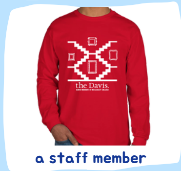
a staff member