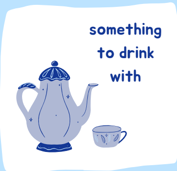
something to drink with