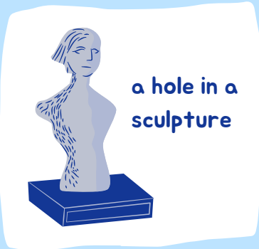
a hole in a sculpture

Can you find all the items on this list?