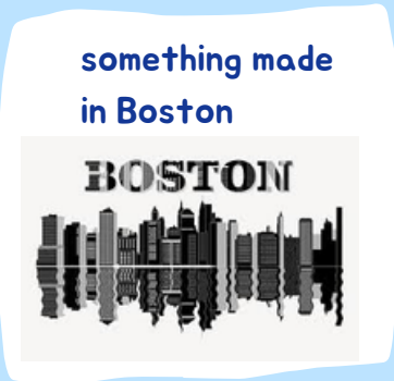
something made in Boston