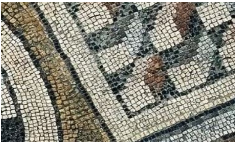
Detail from Mosaic Floor from the Villa of Daphne

If you made a mosaic, what shapes would you use?