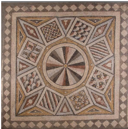
Mosaic Floor from the Villa of Daphne, Roman Imperial period, 5th century C.E., from Yakto Complex, near Antioch, Mosaic, overall: 157 1/2 in. x 156 in., Given by the Princeton Expedition for the Excavation of Antioch and Vicinity, 1936.33.