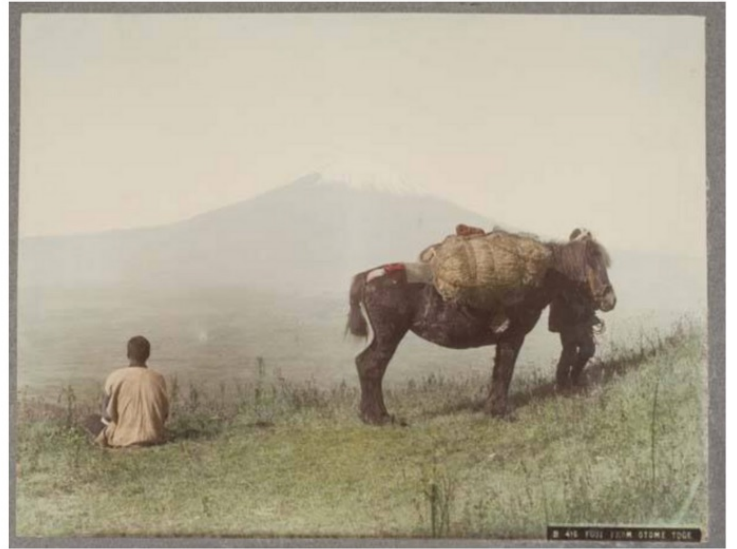
Japanese, Mt. Fuji from Utome Toge, 1865-75, albumen print and hand colored, Gift of the Wellesley College Art Department Slide Library 1983.24.123

¿Cuáles son los las vistas, olores, sonidos, y sabores de este lugar? ¿Por qué has visitado allí?